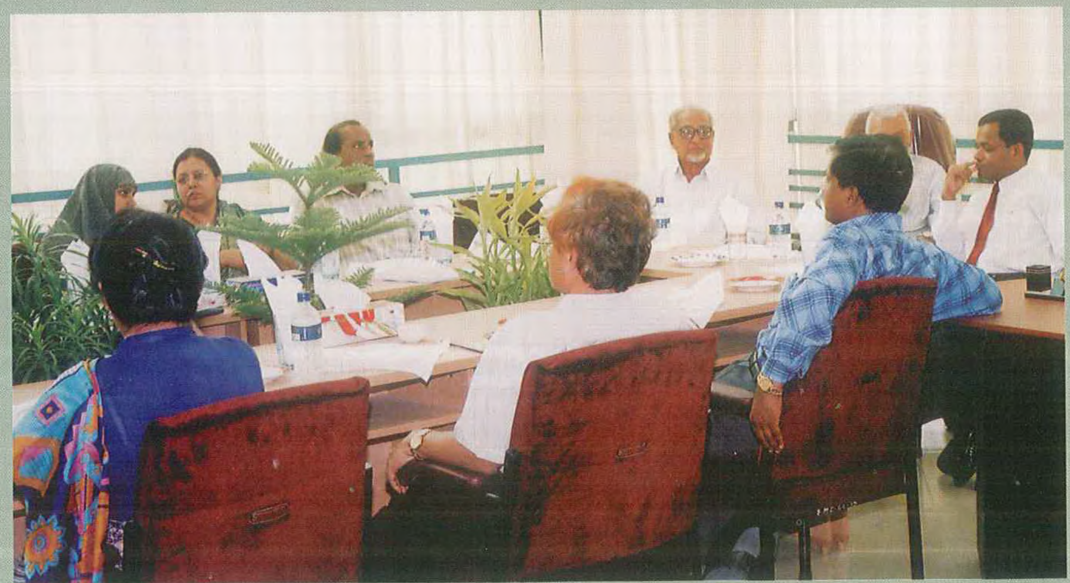
Principal & Vice Principal with the inspection team in the College Conference Room 2004