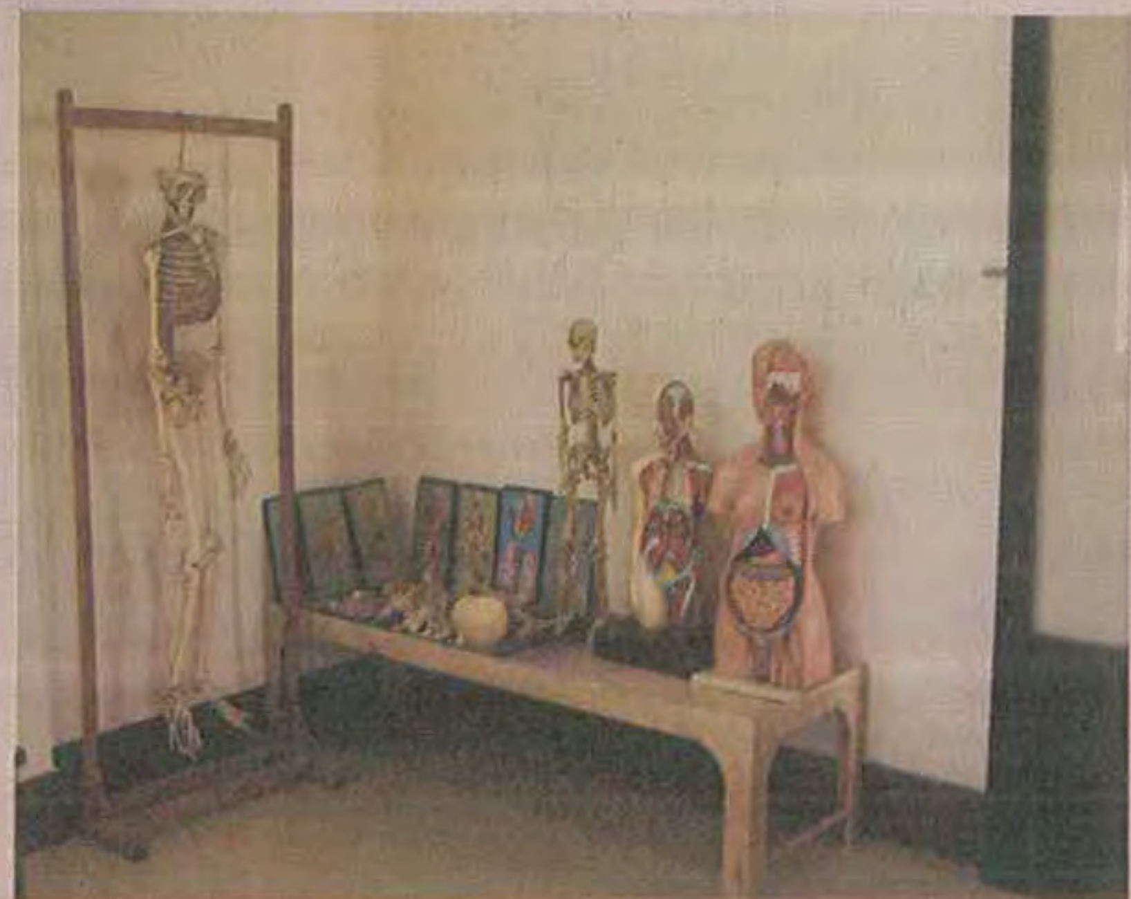
▼ Department of Anatomy