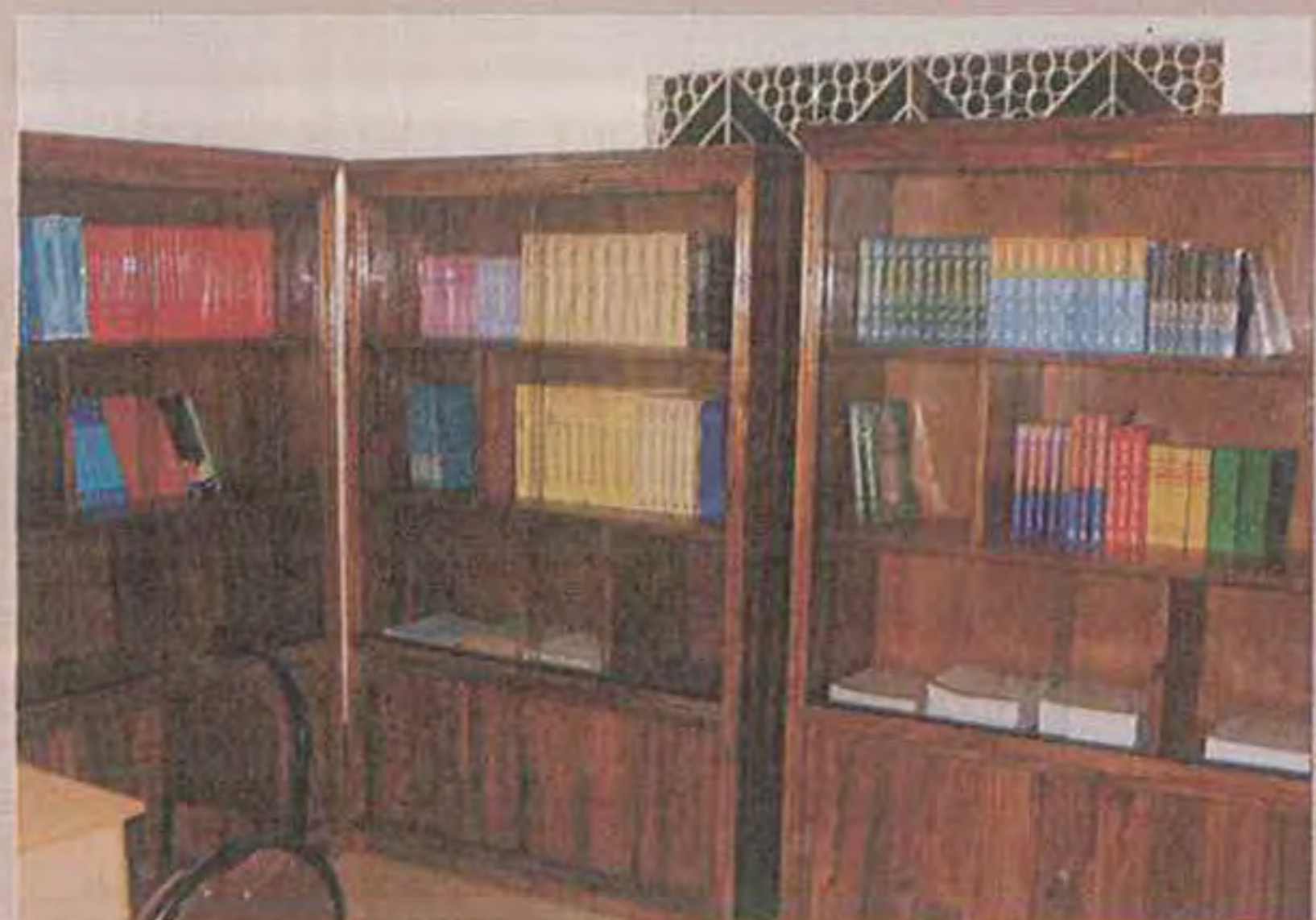
▼ Library of EMC