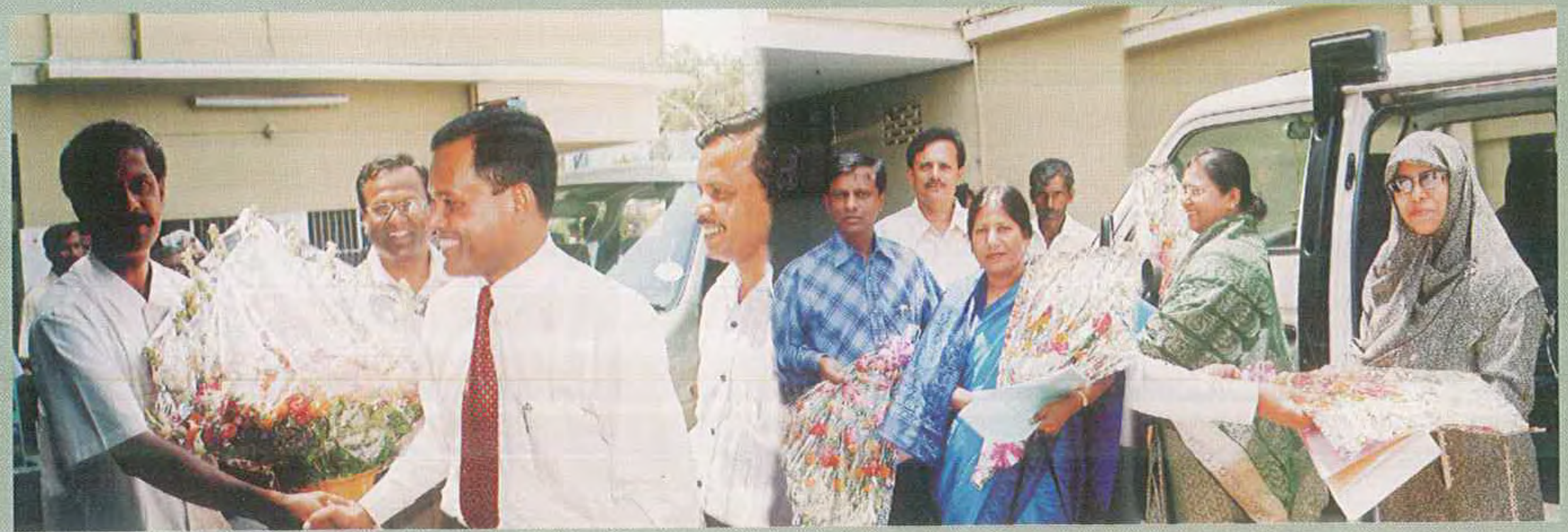
Reception of inspection team of Ministry of Health in the College Campus 2004