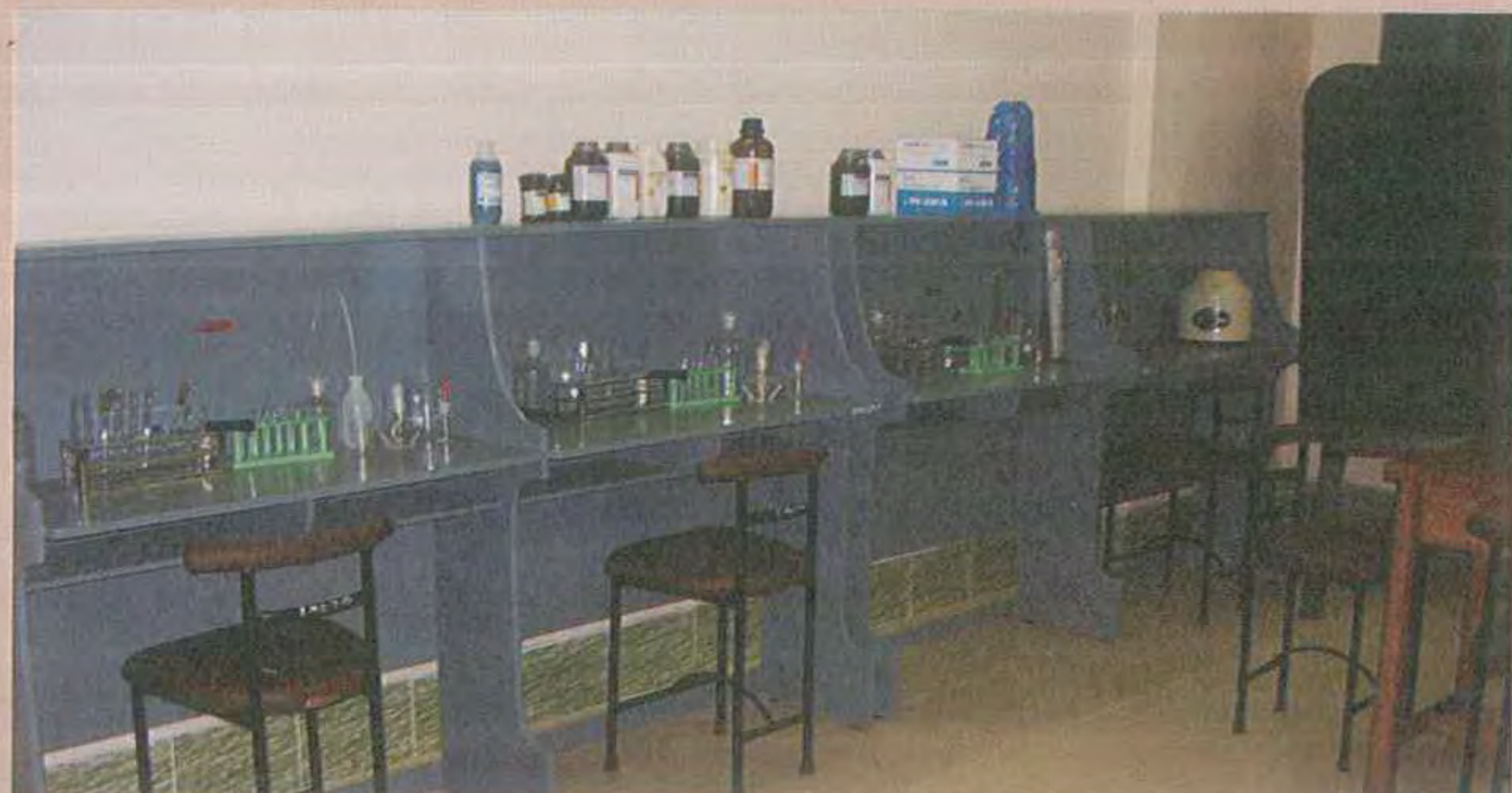
▲ Department of Bio-Chemistry