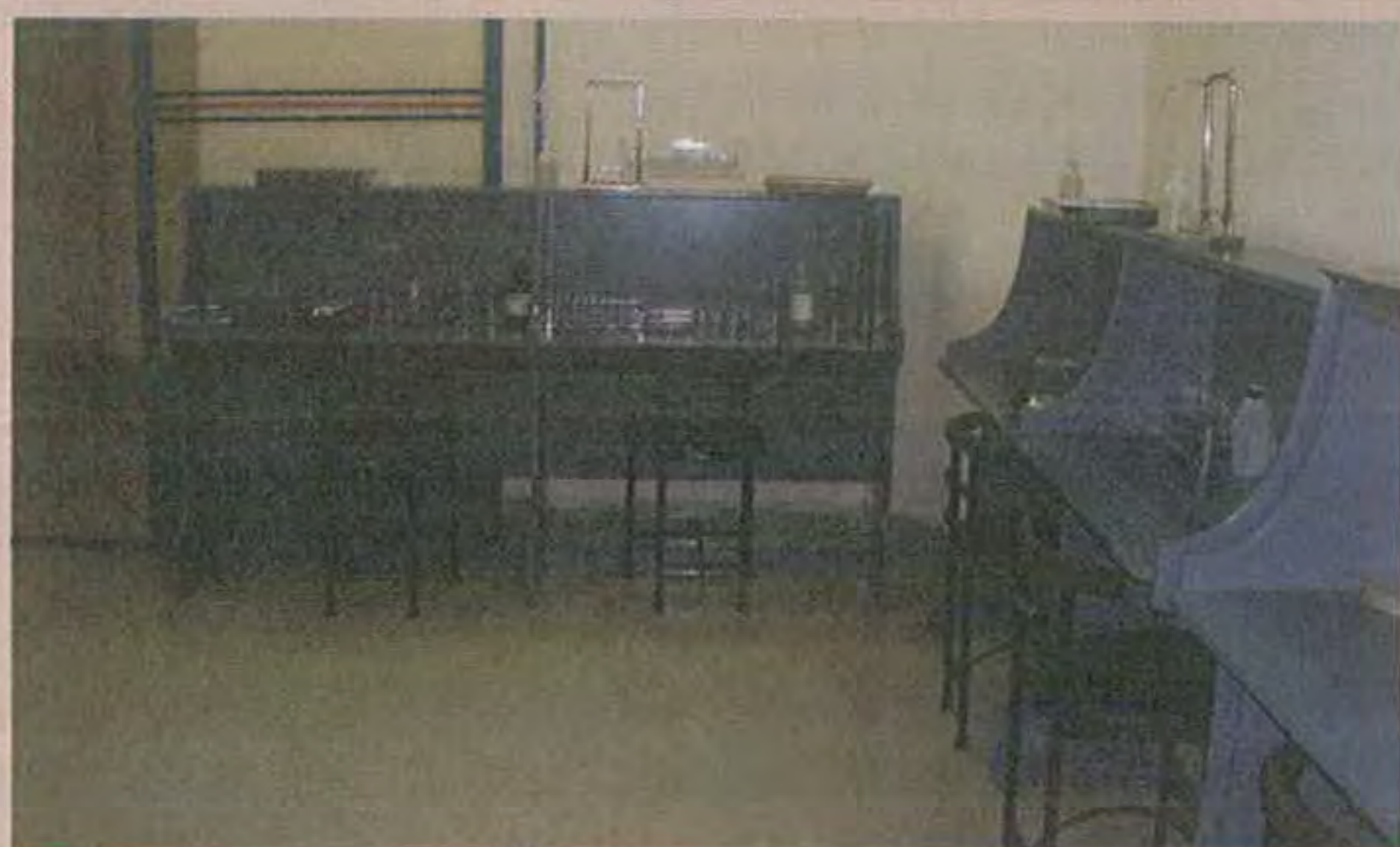
▲ Department of Physiology