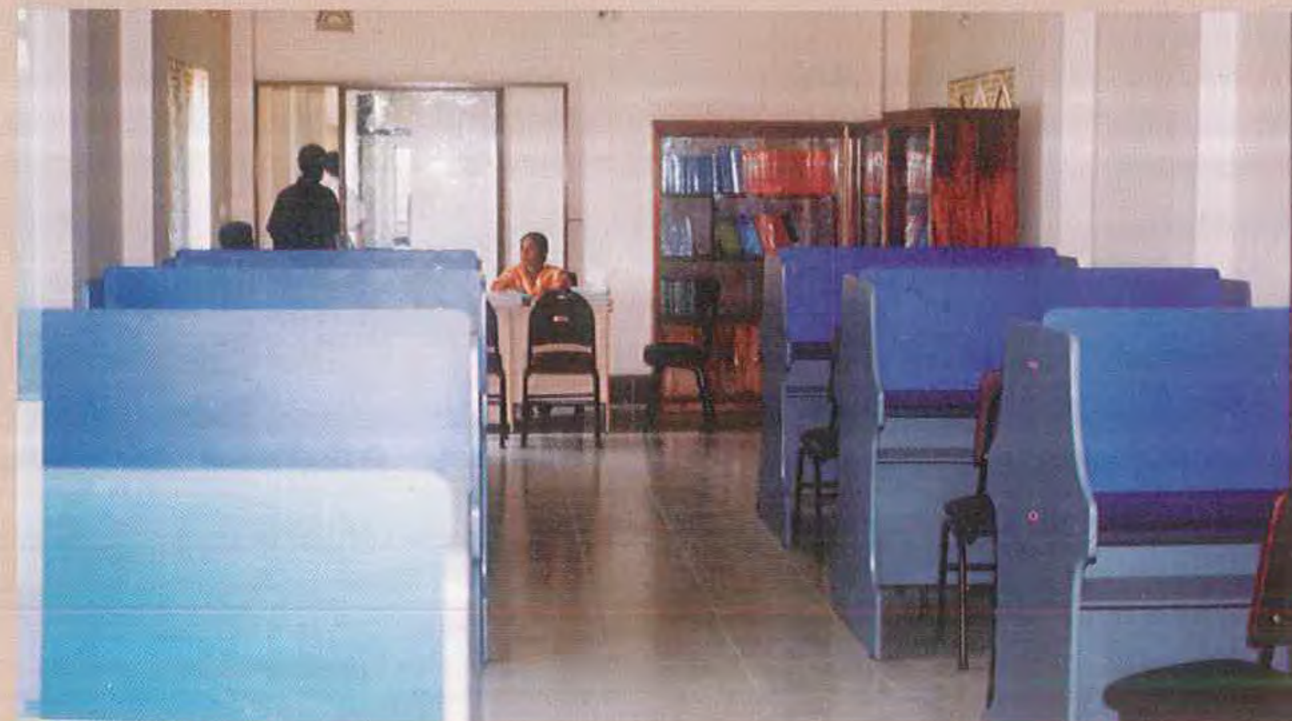
▲ Lecture Theatre of EMC