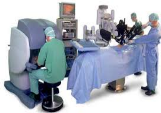
Figure 2: Robotic Surgery.

In five of the six reviewed comparative studies showed that, operating times were significantly longer in the robotic group compared with the conventional laparoscopic group 21,22 . Only the study by Giep et al. showed no significant difference in operating times. Most recently, authors published a comparative report of series of patients undergoing robotic radical hysterectomy and patients undergoing laparoscopic radical hysterectomy or open abdominal radical