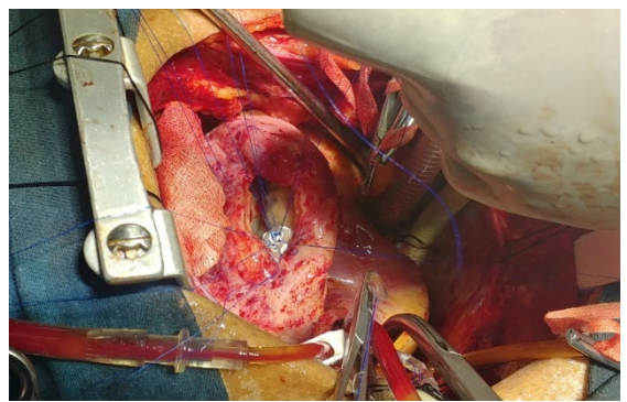
Figure-2: Photograph showing PTFE patch closure of Ventricular septal rupture